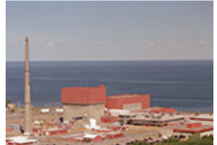
FitzPatrick Nuclear Power Plant