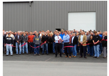
Universal Metal Works - Davis-Standard