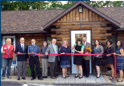
Happy Hearts Childcare