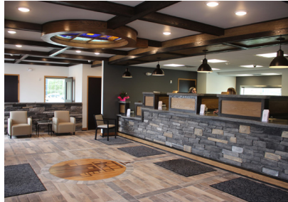
Oswego County Federal Credit Union